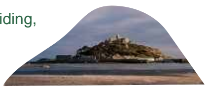
St Michael's Mount